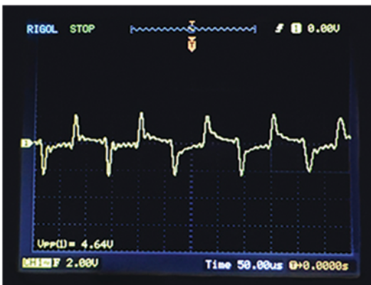
Shaft Voltage with Fiber Ring