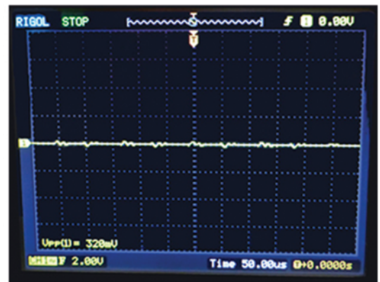
Shaft Voltage with BPK-4

These results illustrate that a Helwig BPK effectively insures against the risk of bearing damage by reducing induced shaft voltage significantly, therefore improving the life of the motor. Peak-to-peak voltage for Helwig's solution is more than 5 times lower than the fiber ring.